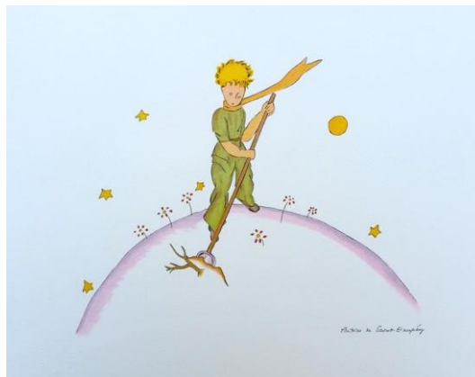
Antoine de saint Exupery. The Little Prince on his Grand Volcano

“On the morning of his departure he put his planet in perfect order. He carefully cleaned out his active volcanoes. He possessed two active volcanoes; and they were very convenient for heating his